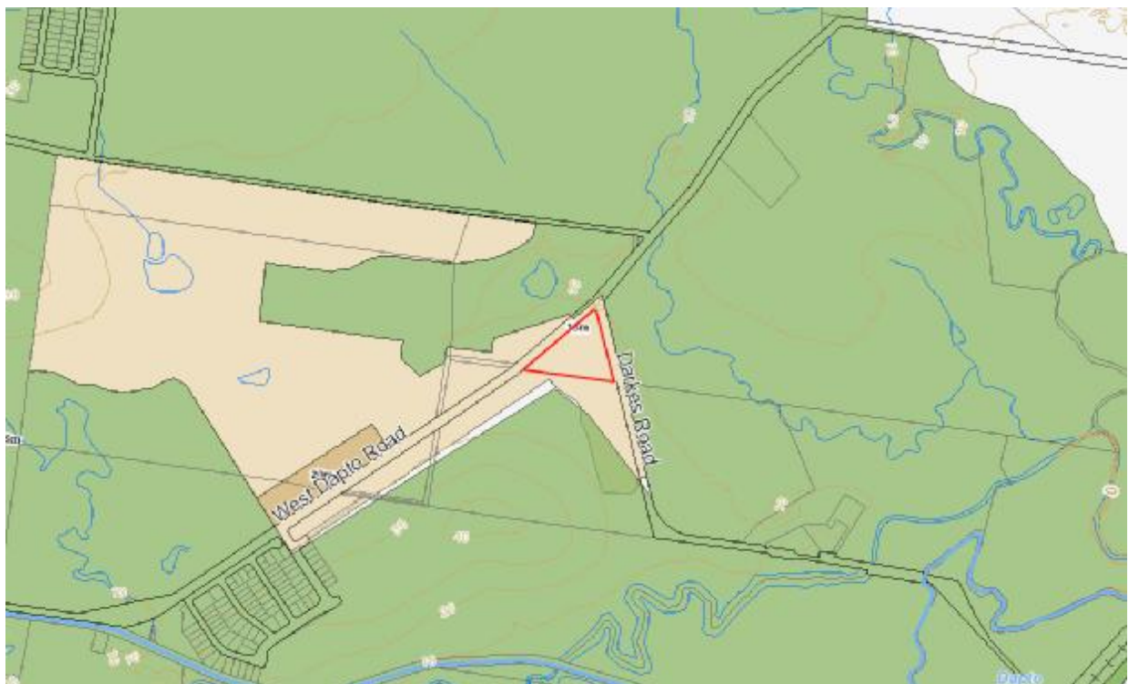
Wollongong Local Environmental Plan 2009, Building Height Map