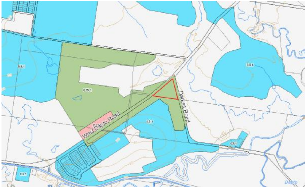
Wollongong Local Environmental Plan 2009, Floor Space Ratio (FSR) Map