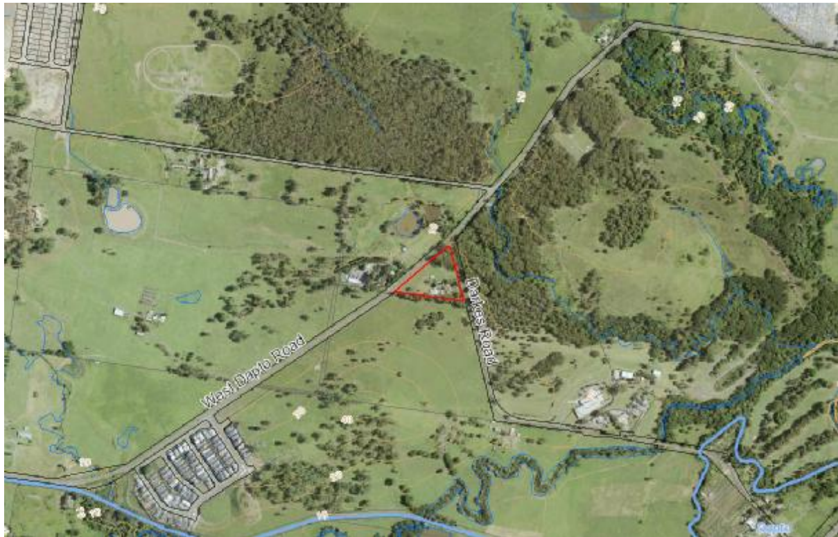
2018 Aerial Photograph